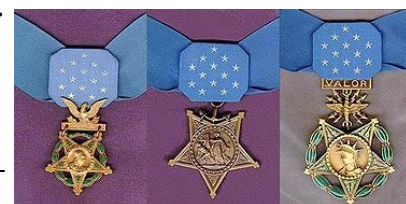
Army Navy Air Force

Each service has its own unique design of the medal, except the Marine Corps and Coast Guard who use the Navy's Medal.